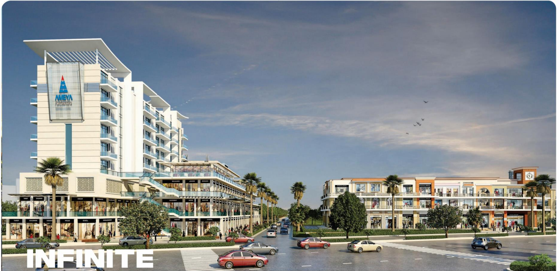
Front view of Sapphire 93