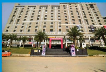
SAPPHIRE 83 Gurgaon