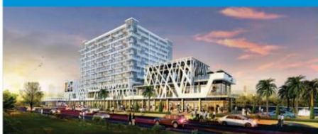
SAPPHIRE 92 Gurgaon